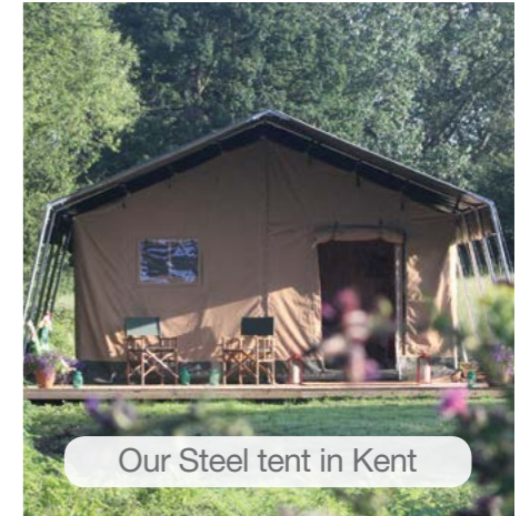
Our Steel tent in Kent

Specifications: This camel coloured Bell tent is made from Residential TenCate canvas & is fully water & rot proof for up to 10 years. • Our Bell Tents are also available in 4 metre size from £505 ex VAT & Campshield TenCate canvas, call us for more information on the full range.