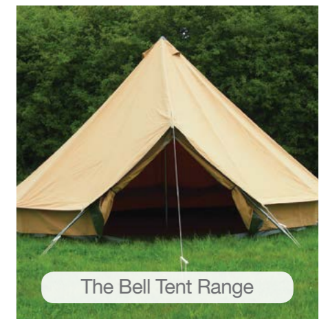
The Bell Tent Range