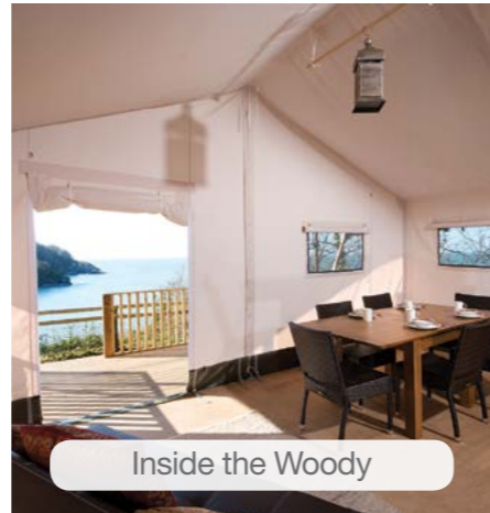
Inside the Woody