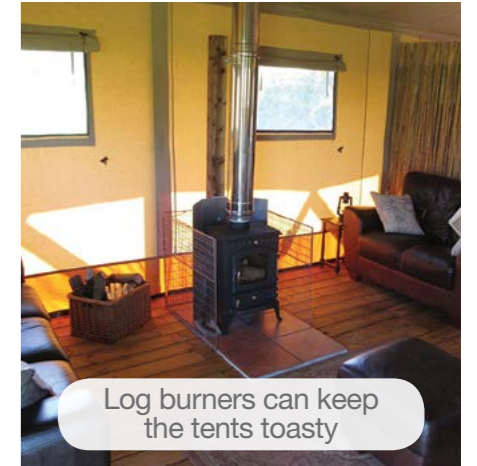
Log burners can keep the tents toasty