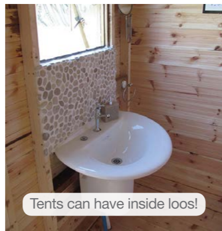
Tents can have inside loos!