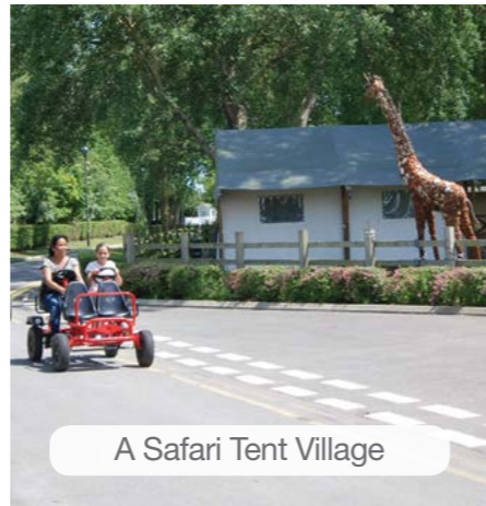
A Safari Tent Village