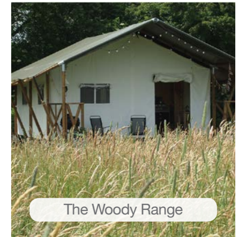
The Woody Range